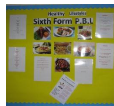
6 th Form

Projects included decorated tiles for a display in our school foyer, a recipe pack and a bus leaflet for Arriva.