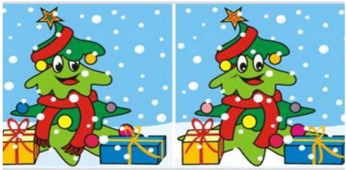
Spot the difference!

Wishing you good health and happiness for 2023 from all the staff at Hillcrest School.