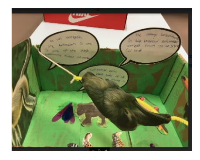
KS3- Class SK Poisoned makeup

We can't wait to see what the Summer Term holds!