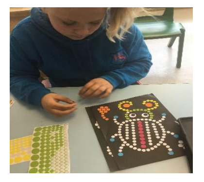
There have been endless acts of kindness within the group, celebrating every birthday, playing

We have enjoyed making our wonderful craft creations using a variety of materials and of course one of our students raising over £106 for The Meningitis Research Foundation.