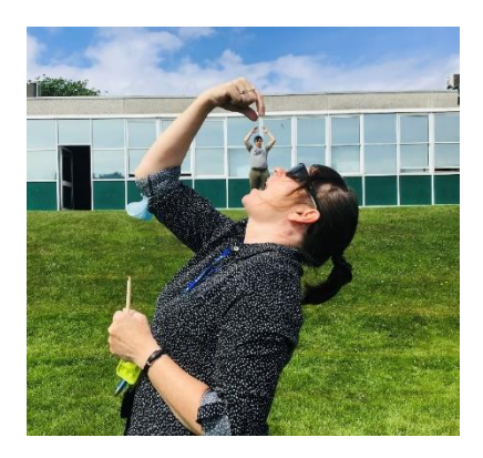
"Crazy teacher eats student, 2021 colourised"

Here is some photography the students did this term: